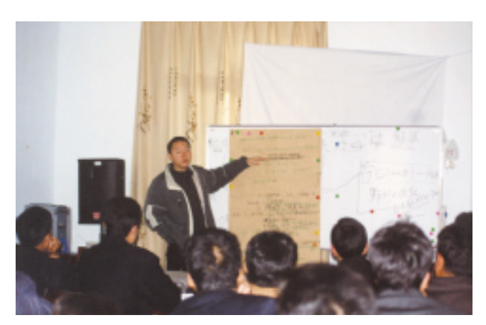
Training session. 培訓授課情況。

To facilitate their daily operations, the Society donated various monitoring and patrolling equipment to the Reserve. These included computers, GPS, cameras, binoculars and compasses. This equipment has been distributed to the management office and reserve stations to improve their day-to-day operations.