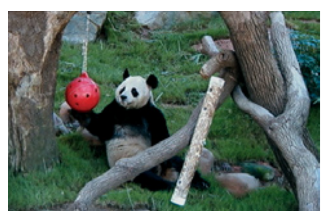
An An and his toys (environmental enrichment items). 安安和他的玩具 (環境豐富項目) \circ

Captive animals are excellent subjects for scientific study due to better environmental control and accessibility. It is especially true for endangered species like giant pandas as the numbers in the wild are very limited. Results and findings will enable scientists to better understand giant pandas' natural behaviours, biology and their welfare requirements with direct impacts on their health, survival and reproduction. Such information can be applied to their wild counterparts and conservationists can utilise the results to formulate effective conservation strategies in protecting wild giant pandas and their habitats.