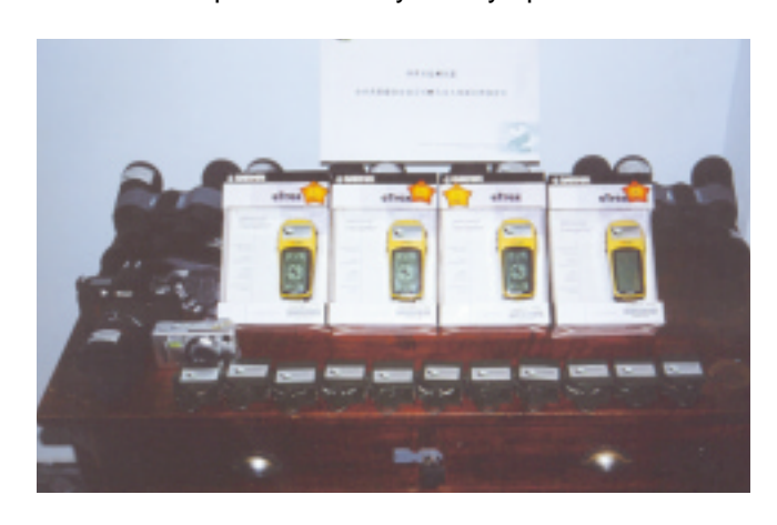
Monitoring and Patrolling Equipment donated to the Nature Reserve.

To facilitate their daily operations, the Society donated various monitoring and patrolling equipment to the Reserve. These included computers, GPS, cameras, binoculars and compasses. This equipment has been distributed to the management office and reserve stations to improve their day-to-day operations.