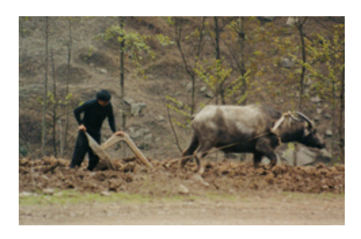
Local people still use conventional farming methods. 當地人仍利用一些原始的耕作方法。

馬邊大風頂自然保護區位於四川涼山彝族自治區,是一個國家級大熊貓保護區。 保護區內保存了豐碩的動植物品種。根據1989年的全國大熊貓調查,那裡是約三十頭大熊貓的老家。然而,有別於其他知名的大熊貓保護區,那裡面積較細小和偏遠,一直沒有吸引到國際的關注、支持和援助。當地人一般較為貧窮,仍沿用「靠山食山」的原始生活方式。保護區管理局主要依靠寥寥可數的辦公室設備,員工亦甚少獲得受專業教育的機會。