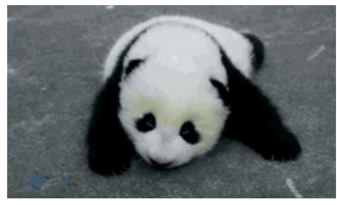
A lovely panda cub. 一隻可愛的年幼大熊貓。

In collaboration with CRCC, HKSPC will launch a panda adoption programme to raise funds for the Centre to procure veterinary equipment and facilities to care for their panda populations. Donors of this programme can receive the naming right of the panda cub, periodical updates of the adopted cubs and a tailor-made visit to Wolong Nature Reserve to meet the adopted cub. To commemorate their generous support, donors' names will be inscribed on a gold signature brick located at the entrance of Hong Kong Jockey Club Giant Panda Habitat at Ocean Park.