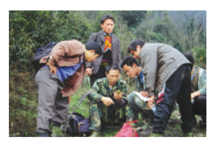
Participants used GPS to record their location with the guidance of experts from Mainland China. 內地專家正指導學員利用GPS記錄所在位置。