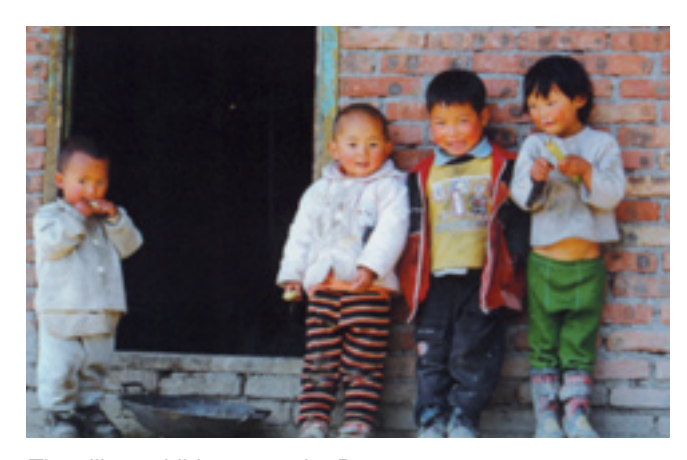
The village children near the Reserve. 保護區附近的村童。

Located in the "Yi" tribal autonomous region in Liangshan, Sichuan, Mabian Dafengding Nature Reserve is a national grade giant panda reserve. This Nature Reserve is rich in animal and plant species, including approximately 30 giant pandas. However, unlike other well-known panda reserves, it is relatively small and inaccessible; therefore it receives little international attention, support or assistance. Local people are generally poor and without the means to separate their lives from the reserve. The management office of the reserve also faces many challenges such as operating with only minimal office equipment and most staff have limited technical expertise.