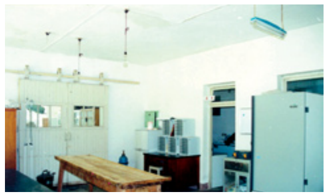
Interior of the Giant Panda Veterinary Hospital. 原有獸醫院的內貌。

The Centre cannot continue its impressive work towards giant panda conservation without adequate facilities. In December 2002, the construction of the new veterinary hospital was completed, but financial support for the procurement of research and medicinal equipment was still lacking. Thus, HKSPC has committed to support the Hospital with a donation of HK$ 1 million for its renovation and the procurement of equipment. The Society will raise funds for this worthwhile cause in the coming years and provide funding to the hospital annually. To commemorate the support from the Society, the new panda veterinary hospital is now named Panda Conservation Hospital, and inscribed Chinese wordings "sponsored by Hong Kong Ocean Park and The Hong Kong Society for Panda Conservation".