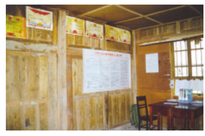
Interior of the Reserve Station. 保護站的內貌。

保護區人員要更有效管理保護區,專業知識和技能實不可缺少。承蒙四川省林業廳和世界自然基金會(中國項目)的支持,協會在二零零三年三月二十二至二十六日期間為馬邊大風頂自然保護區和鄰近地區內的保護人員舉辦了一個監測及巡邏培訓班。