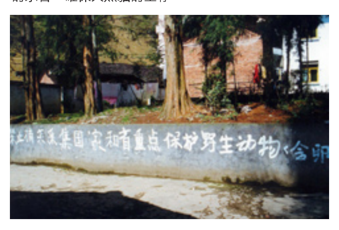
The Reserve Station disseminates wildlife conservation message with a slogan.

承蒙國家林業局和四川省林業廳的支持,協會於二零零一年一月認領了馬邊大風頂自然保護區。協會此項認領計劃的目的,主要是透過改善當地社區的生活實地廣地區的可持續發展,讓當地人、大熊貓和保護區和諧共存,從而確保大熊貓的生存。此外,協會亦知為有保育項目,支持保護區管理局在管理、設施和人員培訓等方面的需要。協會將繼續與內地官方和其他目標一致的機構緊密合作,藉此認領計劃履行協會的宗旨,確保大熊貓的生存。