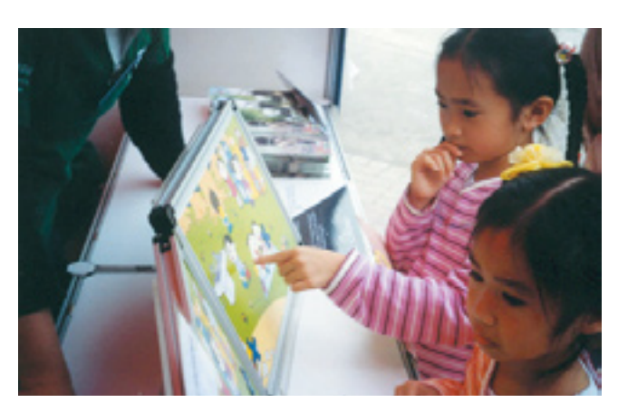
The "Spot the Difference" Game. 「考考你眼力」遊戲。

The 7th Ocean Park Conservation Day event on 12th January 2002 provided an excellent opportunity for the Society to promote public awareness for the pandas' plight. Visitors of all ages showed great interest in the colourful drawings and cute characters of the fun-filled game: "Spot the Difference". Each participant not only learnt intriguing information, such as giant panda features, conservation issues affecting the pandas and how they can help the environment, but they also took home a limited edition of the panda key chain. Our exhibition panel attracted an eager crowd who wanted to know more information about giant pandas.