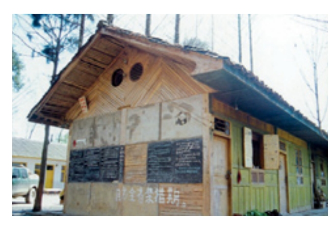
The reserve station at Gaozhouying. 位於高卓營的保護站。

With the support of State Forestry Administration (SFA) and Sichuan Forestry Department (SFD), the Society adopted Mabian Dafengding Nature Reserve in January 2001. The overall objective of the Society's adoption programme is to ensure the giant pandas' survival through improving the livelihoods of local communities, promoting sustainable development of the area and establishing a harmonious relationship among local people, giant pandas and the nature reserve. Moreover, the Society endeavours to identify conservation projects that support the management, facilities and staff capacity building in the Nature Reserve. The Society is dedicated to achieving its mission to ensure the survival of giant pandas through this adoption programme and by working closely with Chinese officials and other like-minded conservation organisations.