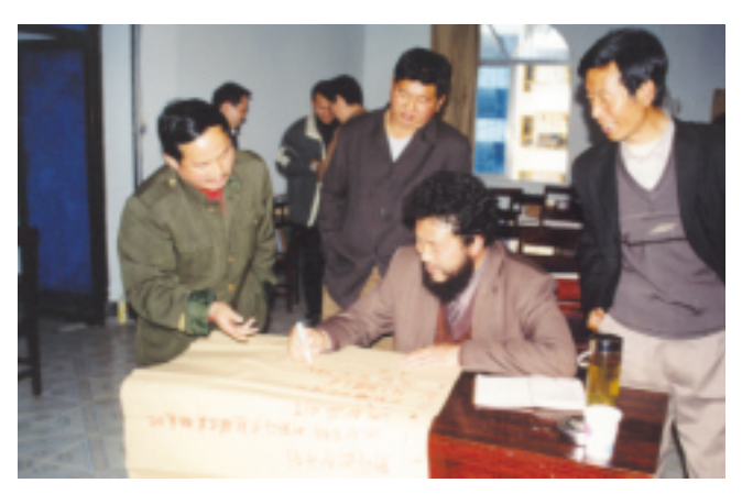
Participants formed groups to draft an action plan for monitoring and patrolling in their respective Reserves. 參加者正分組為各自的保護區草擬監測巡護的行動計劃。

Through lectures, group discussions and field exercises, the workshop taught basic knowledge, including conservation concepts and ecology of giant pandas, the skills of patrolling and monitoring, and the use of important equipment such as Global Positioning System (GPS) and map reading. Standard procedures, recognised by SFD, were used to teach data collection, monitoring and patrolling techniques. The application of these standard methods will enable the more systematic acquisition of reliable and scientifically sound data on giant pandas and their habitat. Exchange of reliable data and information generated through these recognised procedures will add to the existing database and facilitate scientists to formulate proper conservation plans for the giant pandas.