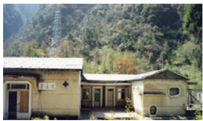
The original Giant Panda Veterinary Hospital with simple facilities and limited capacity for giant pandas.