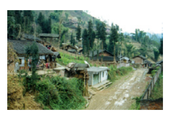
Village at the border of the nature reserve. 位於保護區周邊的村落。