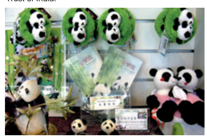
Part of the sales proceeds of the ECOSYS-ECOFUN merchandise will be donated to the Society. ECOSYS-ECOFUN貨品的部份銷售收益將捐贈予本協會。

In January 2003, the Society became one of the beneficiaries of an eco-marketing programme entitled ECOSYS-ECOFUN organised by The 100 Percent Concept Asia-Pacific Limited. Through this programme, the company will set up a collection of products based on endangered wild animal species to promote animal conservation awareness. A portion of the sales proceeds of this project will be donated to the Society to support ongoing projects in education and conservation. Ecosys-ecofun supports other conservation foundations worldwide. These are Ocean Park Conservation Foundation, Orbis, OceanNenvironment, Animals Asia Society, Ecoliers du Monde, Lewa Wildlife Conservancy and Wildlife Trust of India.