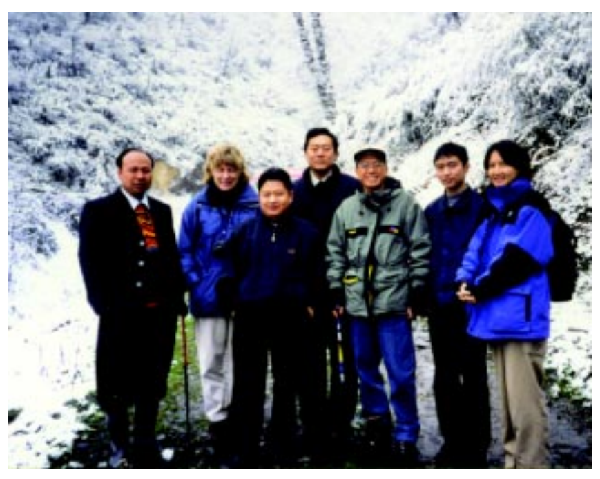
We are already at the Reserve's periphery, but need to climb to 2,000 metres to its entrance. 雖已身處保護區的外圍,但仍需攀登二千米始到達保護區的入口。

我們沿著曲折的山路徐徐上山,眼 見路旁陡峭山坡上一排排悉心栽種 的農作物,教我深切體會到當地居 民的生活是如何艱苦。那些山坡的 陡峭程度,叫人舉步難行,更違論 以機器協助耕作或收割。據聞當地 政府正考慮將彝族農民遷往山下城