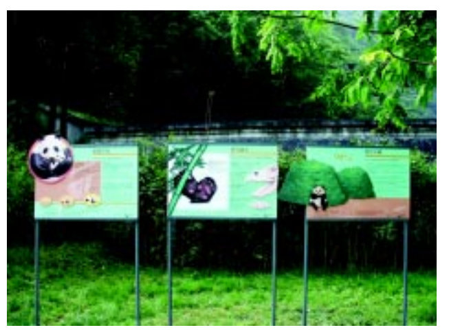
Educational panels being displayed at the China Research and Conservation Centre for the Giant Panda. 於中國保護大熊貓研究中心展出之敎育展板。