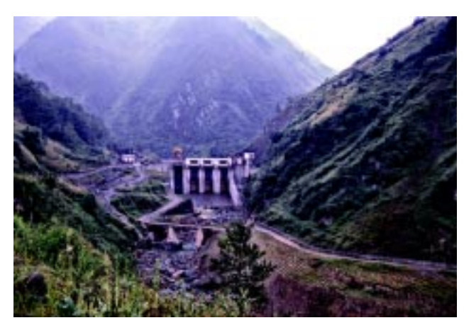
A hydropower plant at Mabian. 一座位於馬邊的水力發電站。

二零零零年九月,本會與中國探險學會合作,就馬邊社 區進行了初步研究,目的是搜集當地社會、文化及經濟