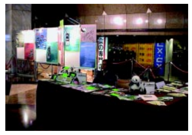
Public exhibitions to disseminate the message of panda conservation. 舉辦巡迴展覽,宣揚熊貓保育訊息。