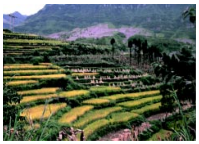
Landscape of Mabian. 馬邊一帶景致。

The overall goal of this long-term adoption nature reserve programme is to help the local communities of Mabian, whose lives are affected by the establishment of the nature reserve, to develop sustainably in harmony with the nature reserve. By working closely with China's State Forestry Administration (SFA) and Sichuan Forestry Department (SFD), HKSPC will assume a facilitative role in influencing and facilitating at policy level development and conservation plans that will benefit the local communities, the giant pandas and the nature reserve.