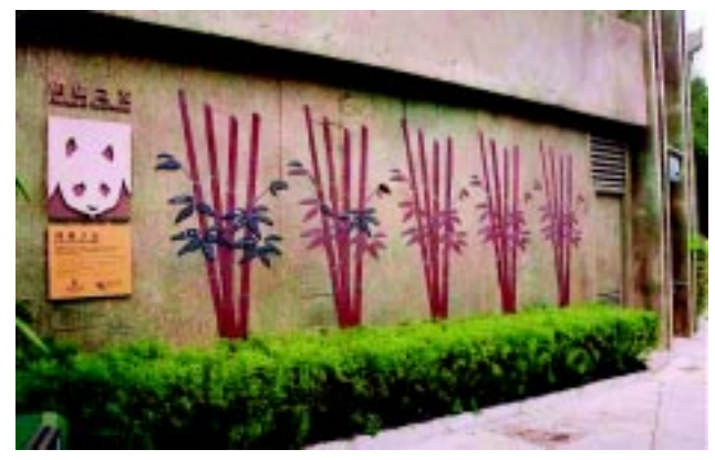
New bamboo wall. 新設的竹製榮譽牆