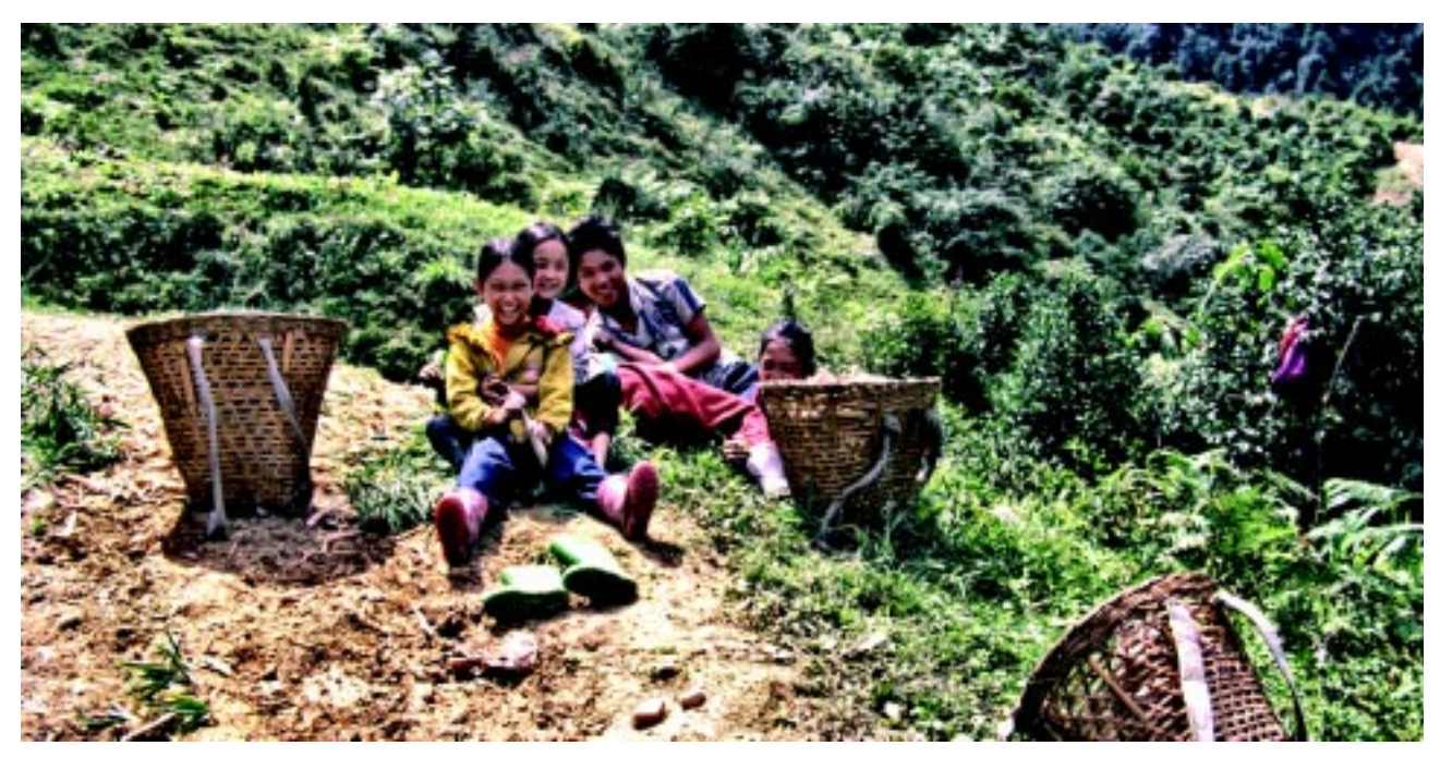
Village kids who collect bamboo shoots.收割竹筍的村童