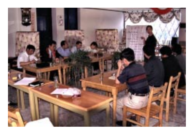
Meeting with local officials to discuss future conservation works in Mabian. 與當地官員舉行座談會,討論馬邊的保育計劃。

另外,研究又發現有需要集中於馬邊一個較小地區進行 試點研究,以深入搜集關於當地社區的具體資料,從而 制訂適當的發展計劃。選擇永紅鎮作為試點研究對象, 乃因該處鄰近馬邊大風頂自然保護區,而週邊社區的日 常生活亦與自然保護區息息相關。