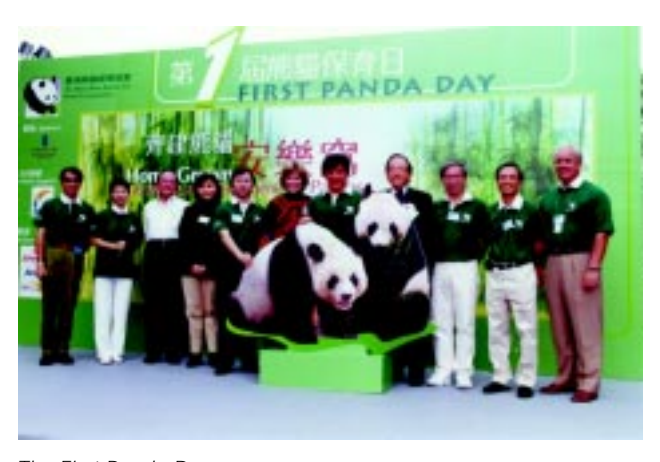
The First Panda Day. 第一屆熊貓保護日。