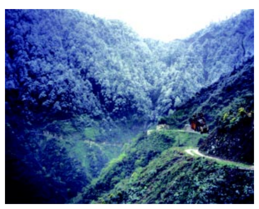
Snow capped mountain. 白雪蓋頂的光戀。