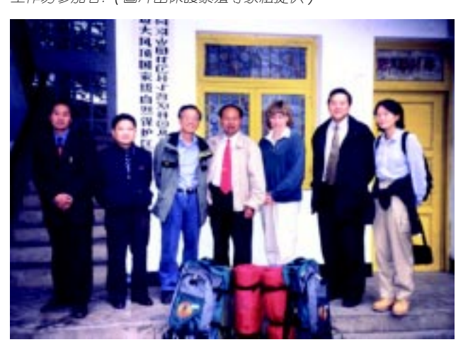
Donation of camping gear to Mabian. 捐贈露營裝備予馬邊自然保護區